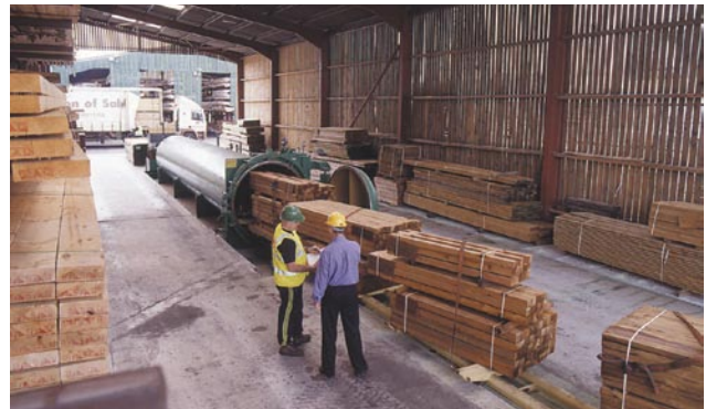
Vacuum high pressure treatment plant.

contact – providing a desired service life ranging from 15 to 60 years. The vacuum process forces the preservative deep into the cellular structure of the timber and generally results in a pale green coloration to the finished component. Additives are available that can give either a rich brown coloration, usually for rough sawn fencing and landscaping timbers, or an effective extra water repellency protection for decorative external timbers, such as decking and cladding timbers.